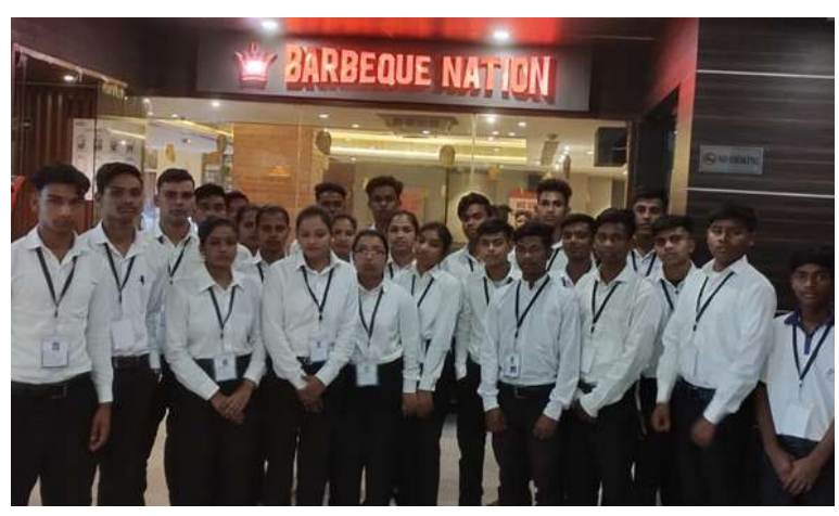
Industrial visits also make the students familiar with the working environment, which they will ultimately be facing after successful completion of training and certification.

The above candidates from Food & Beverage Training Program under DDUGKY at our Jharkhand centre have successfully completed their training and certification. They are now proudly placed at the famous "The Fern Hotel" in Lonavala, Maharashtra.