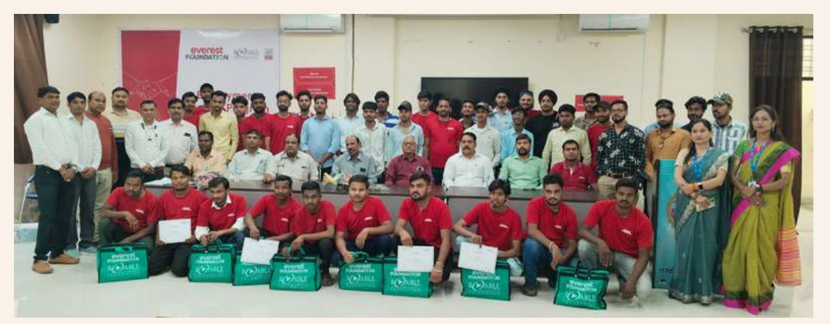
Certificate & Tool Kit Distribution during Employment Connect Program in Indore

Everest Foundation provided tool kits to all certified candidates to help them start their work.