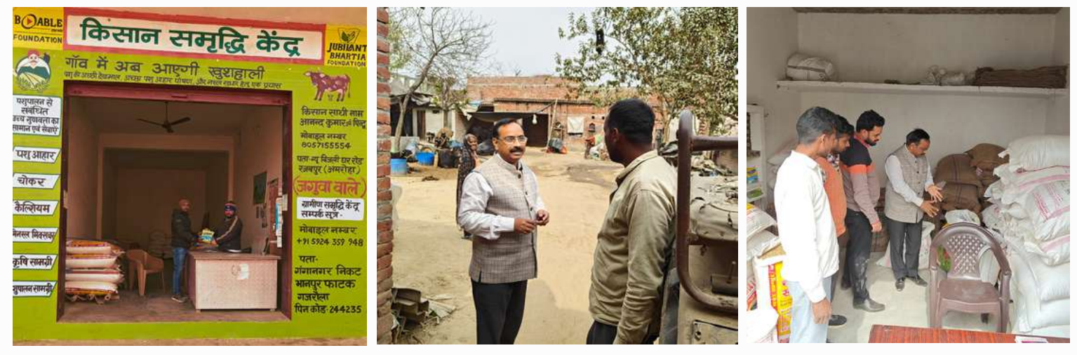
Inside Kisan Samriddhi Kendra

To improve farm economy, it is important to transfer knowledge about latest technology and farm practices to farmers. In this context, Jubilant and B-ABLE Foundation are continuously making efforts under the Cattlefeed Entrepreneurship Development Program in six blocks of Amroha district of Uttar Pradesh namely Amroha, Gajraula, Dhanaura, Hasanpur, Joya, and Gangeshwari.