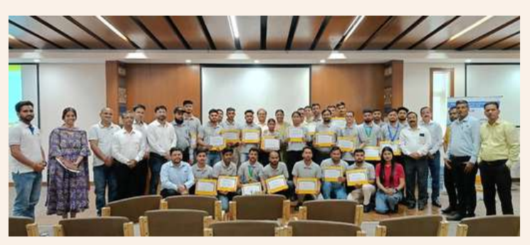
Backhoe Loader Technician certification ceremony

Our 21 candidates got certified as Backhoe Loader Technicians on March 30 at Unnati in Greater Noida. This batch consisted of 2 female candidates.