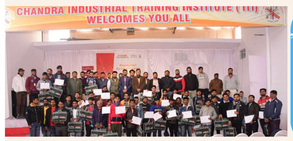
Certificate & Tool Kit Distribution during Employment Connect Program in Lucknow