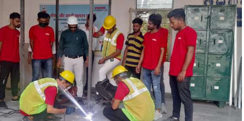
Technical training in progress - Jaipur